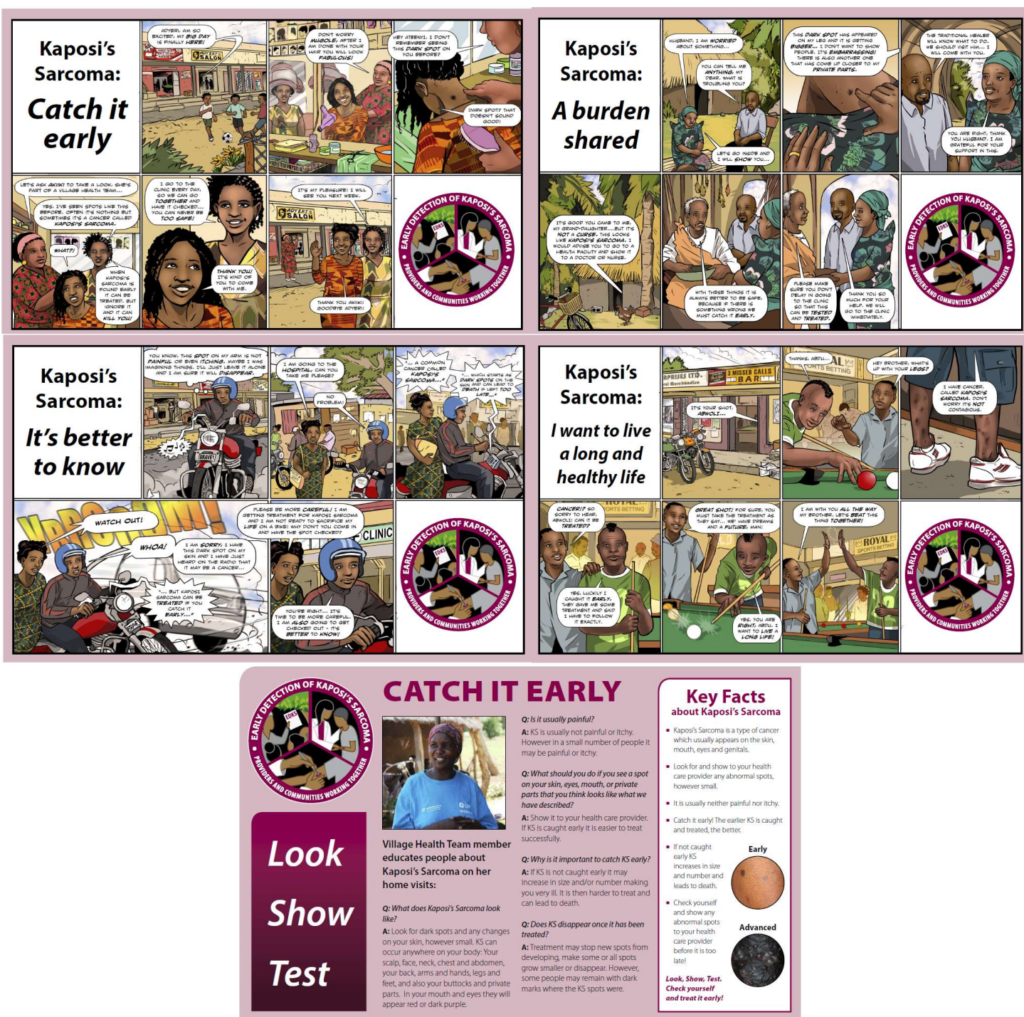
Figure 1. Comic strips, one of three common media forms regarding KS awareness and early detection developed and evaluated among a community-based sample of Ugandan adults.