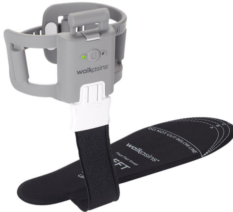
Figure 1. Picture of the Walkasins sensory neuroprosthesis device showing the pressure sensor embedded Foot Pad that is placed in the subject's shoe and connected to the Leg Unit that houses an embedded microprocessor with software, supporting electronics, a rechargeable battery, and four tactile stimulators placed around the lower leg. The system is worn bilaterally. Leg Unit and left Foot Pad shown