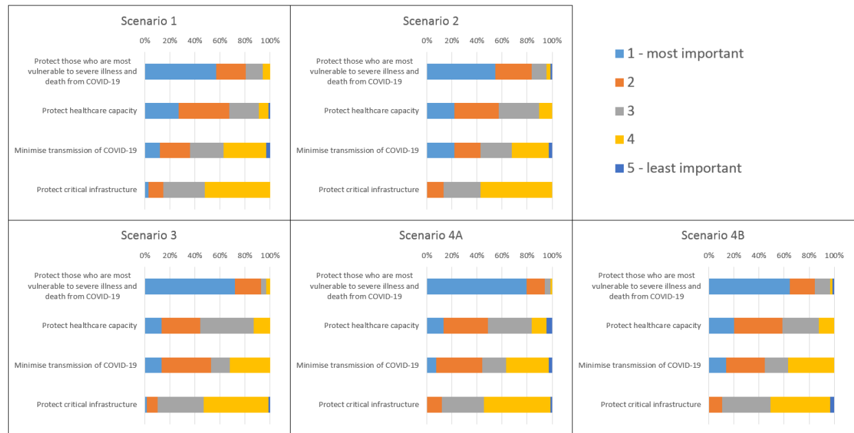
Figure 2. Stacked bar charts comparing the percentage of each ranking contributing to the total for COVID-19 pandemic immunisation strategies for different pandemic scenarios at the time of initial COVID-19 vaccine availability

Scenario 1: The pandemic is still in progress and sustained community-level COVID-19 outbreaks continue. Scenario 2: There is a possible new wave of the pandemic with COVID-19 activity rising again after a post-peak period. Scenario 3: The pandemic is in the post-peak period and COVID-19 activity remains low. Scenario 4A: The pandemic is considered over, but COVID-19 continues to circulate at low levels. There is evidence that the vaccine (or previous infection) provides long-term protection against COVID-19, but a routine vaccination program may be required for new cohorts that are immunologically naïve. Scenario 4B: The pandemic is considered over, but COVID-19 continues to circulate at low levels. There is evidence that the vaccine (or previous infection) does not provide long-term protection against COVID-19 and a routine vaccination program will be required for much of the population.