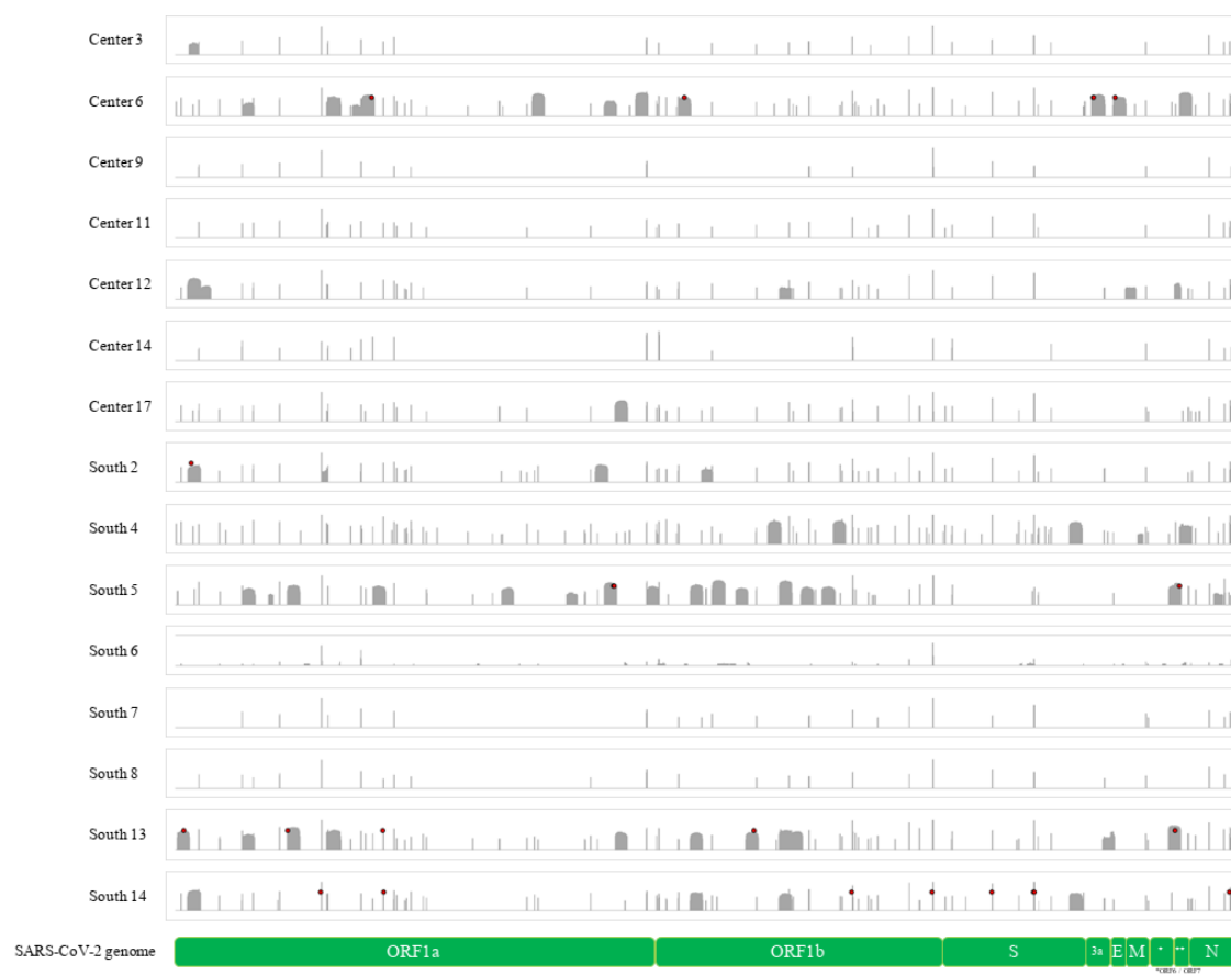
Supplementary Figure S1. Representation of the genome coverage (>20X) in logarithmic scale (max 4.5 log) reached by samples that covered less than 18% of the SARS-CoV-2 isolate Wuhan-Hu-1 genome (MN908947.3).