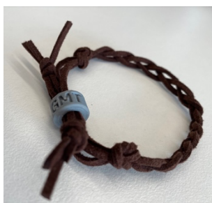
Figure 4. GMT + mindfulness bracelet.