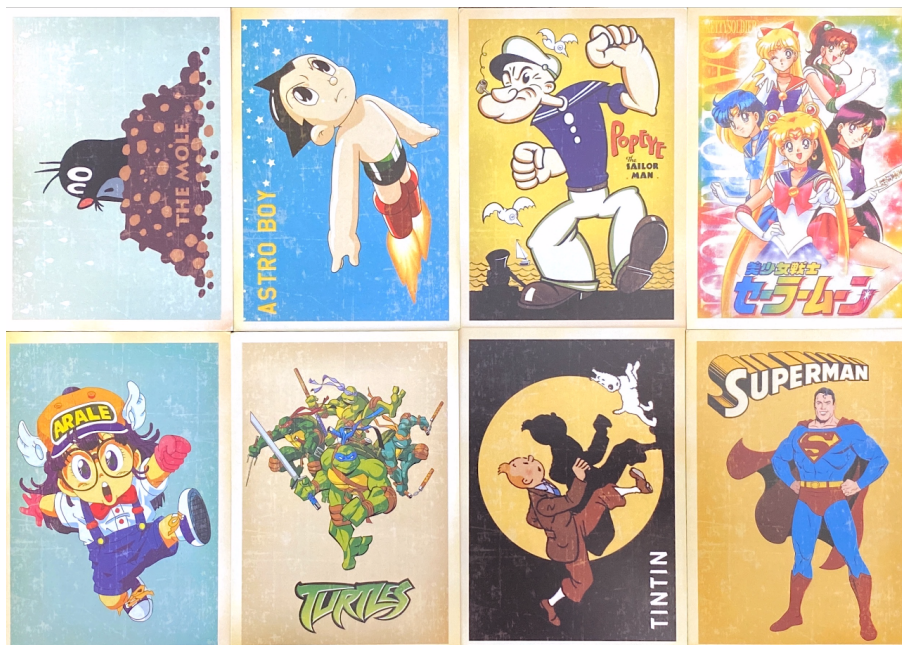
Figure 6. Example of new cartoon sorting cards.