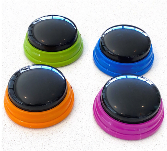
Figure 5. Interactive hand buzzers replaced a ‘hand-clapping’ task to enhance engagement.