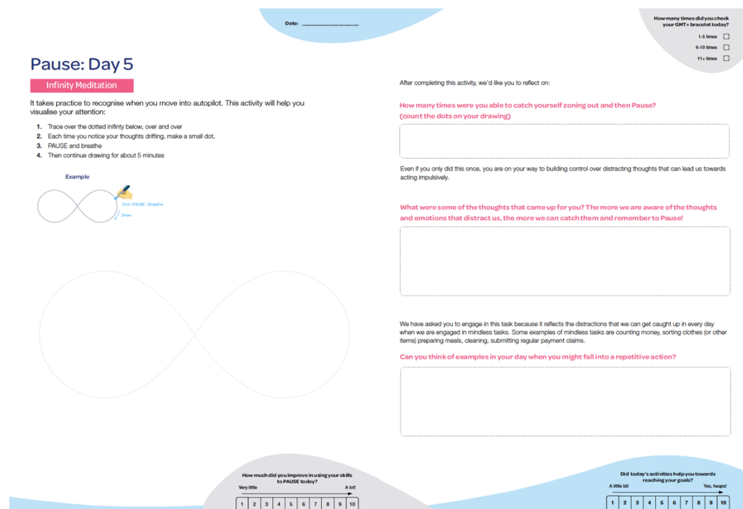
Figure 7. A creative journal activity and guided questions to connect the relevance to everyday life.