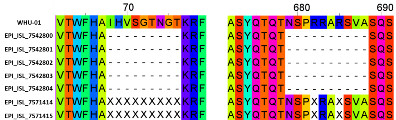
Figure 1: Portion of spike glycoprotein sequence alignment of seven isolates with Wuhan-01 as reference sequence. A 9 amino acid deletion was observed spanning the 68-76 amino acid long region (left panel) while a 10 amino acid deletion was observed spanning the 679-688 amino acid region (right panel).