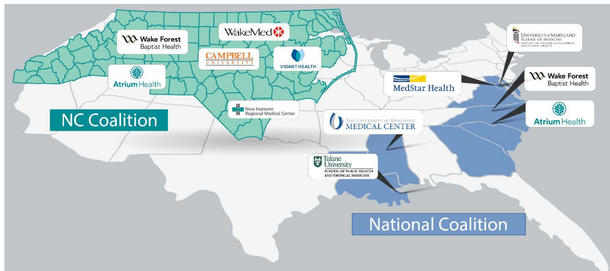
Figure 1. COVID-19 Community Research Partnership Site Locations