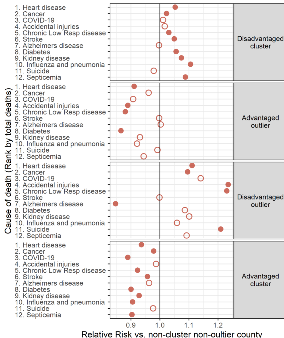
Figure 2. Class and cause of death. Points are cause-specific adjusted relative risks (RR) for counties belonging to an ADI-based disadvantaged cluster, advantaged outlier, disadvantaged outlier, or advantaged cluster vs. non-cluster-non-outlier. Open circles indicate that RR=1 is included in a 95% equal-tail Credible Interval; RR=1 indicates risk of death is independent of cluster type. All RR are adjusted for age, race and ethnicity (whiteness), and place (cause-specific geographic risk modifiers) and are ranked by the total number of deaths within each panel.

Residence in an outlier county was often associated with more extreme RR compared to residence in a cluster. For example, the RR for chronic lower respiratory disease in a disadvantaged outlier was 19.4% higher than a disadvantaged cluster. On the other hand, the RR for Alzheimer's disease in an advantaged outlier was 4.7% lower than in an advantaged cluster.