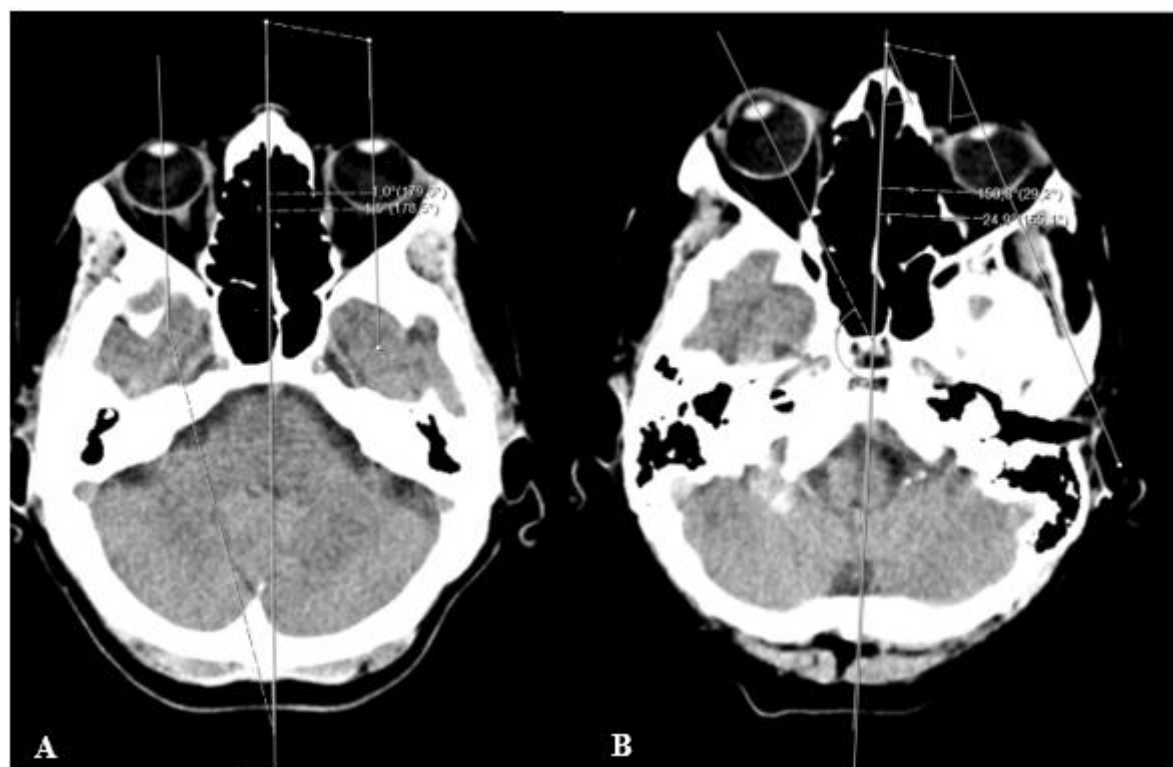
Figure 1. Measurement of the conjugated eye deviation (CED) on a healthy control subject with almost no deviation from midline (A) and on a patient with spatial neglect (B). A line was drawn through the middle section as a „line of best fit“, another two lines were drawn through the ocular axis [11]. The numbers correspond to the measured angles of intersection between the midline and the line of the respective ocular axis.

control group rightward deviations were coded as positive values; leftward deviations as negative values.