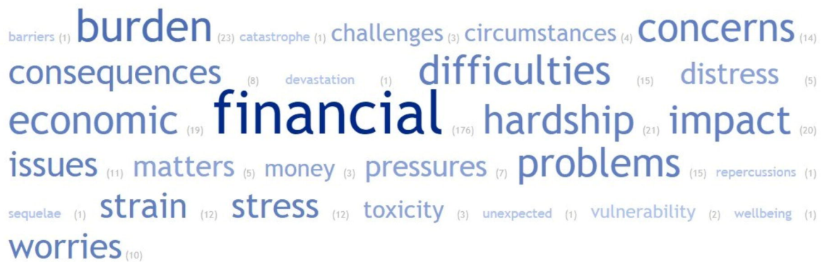
Figure 2: Terms were used to describe the problem of financial toxicity

Note: In each included studies, all term(s) used to describe 'financial toxicity' were listed. 29 lists of terms were then input into a tool to generate the word cloud. The number in the bracket next to each word represent the frequency that word appeared in the lists of terms. The word cloud does not show specific combination of words. In principle, any combination between either economic or financial with a noun is possible.