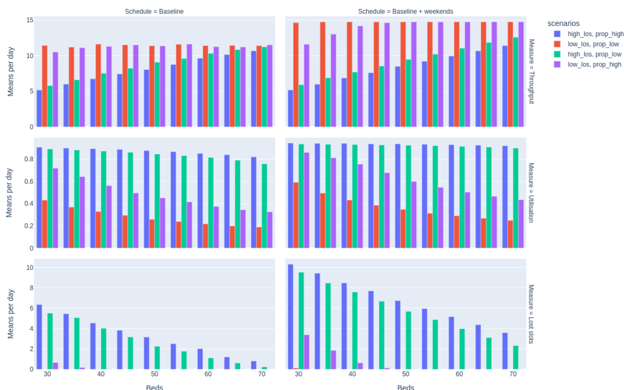
Figure 2: Results of simulations across 30-70 beds, for each of 2 theatre schedules with 4 combinations of lengths-of-stay (baseline:high_los; baseline x0.25: low_los) and proportion delayed (baseline:prop_high; baseline x0.25: prop_low) for mean daily total surgical throughput, bed utilisation, and lost slots.

The results are plotted in Figure 2. The top row displays the mean total daily surgical throughput for each scenario, and for each theatre schedule. The middle row is mean daily bed utilisation. The bottom row displays ‘lost slots’, estimating the extent of the mismatch between patients scheduled and beds available.