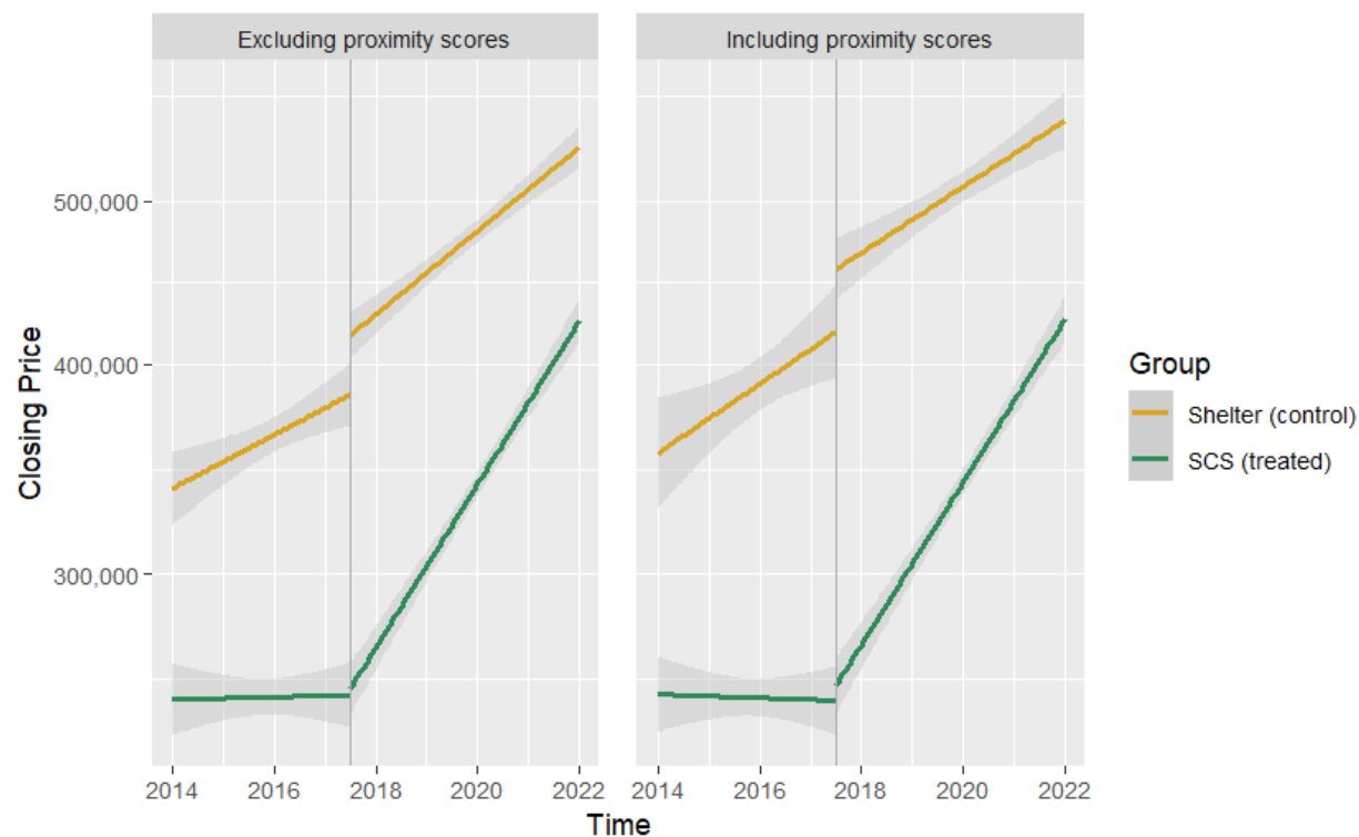
Figure 2: Comparison of price in treated vs. control sales pre- vs. post-intervention implementation controlling for house and neighborhood amenities, with and without proximity scores in models