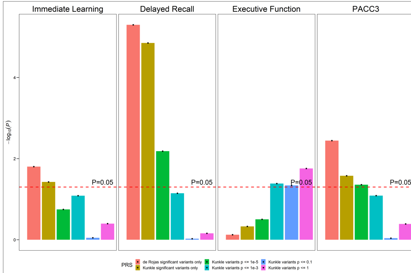
Figure 3. Likelihood Ratio Test (LRT) of the interactions between different PRSs with different P -thresholds, APOE - \epsilon 4 status, and Age

Figure 3 presents the -\log_{10}(P) from the likelihood ratio tests for the three-way interaction terms for all outcomes and different PRSs in WRAP. The likelihood ratio test statistic is calculated as the ratio between the log-likelihood of the nested model (model without three-way interaction terms) to the full model (model with polynomial age*PRS* APOE terms). All association tests are performed using linear mixed effect model with random intercept at subject and family level; Additional covariates include gender, education, practice effects, family history of Alzheimer's, and the first five principal components of ancestry. Age is centered at year 65 and education is centered at the mean. PACC-3 = Preclinical Alzheimer's Cognitive Composite Score-3.