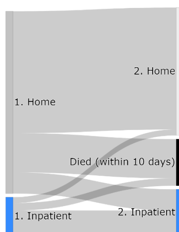
Figure 3: Sankey diagram demonstrating flow between states before and after a resident's first COVID-19 positive test.

Twenty-eight-day mortality is only associated with clusters 10 days after all tests ([4] p < 0.0001 ); residents in the inpatient and inpatient transfer cluster have a slightly higher 28-day mortality than those in the home cluster (8% of 810 and 8% of 578 versus 3% of 1,832). The two clusters with inpatient stays have the same 28-day mortality rate, despite one of the clusters demonstrating a discharge from hospital around halfway through the 10-day period ([4] p < 0.0001 ). Flow between clusters before and after the positive test were displayed in a Sankey diagram ( Figure 3 ). Transitions between these clusters may indicate changes in care based on the positive test. The ‘Died’ after test group here is not the same as presented in the cluster associations previously. Here we identify whether they died within 10 days of their test and were therefore not included in any of the clusters.