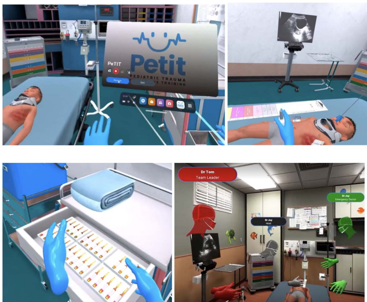
Figure 1. PeTIT VR

This study seeks to examine face and construct validity and represents the initial phase of an extensive research agenda. The platform has been used for research purposes and is not currently commercially available.