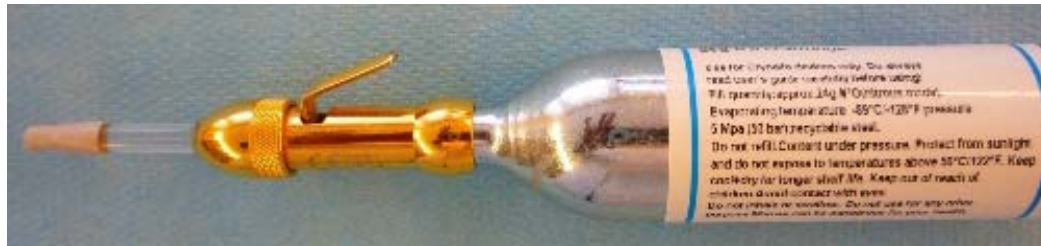
Figure 1: Cryo-auriculopunctur, with compressed nitrogen cannister attached.

pain at the site of stimulation. The device used for cryo-AT (shown in Figure1) is a simple design and easy to use.