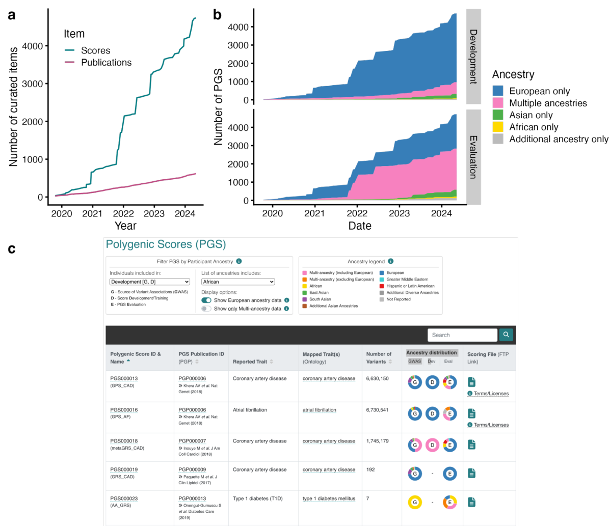
Figure 1. Data growth and improvement of the PGS Catalog. (a) Cumulative numbers of PGS (scores) and publications indexed in the PGS Catalog since inception (October 2019). (b) Cumulative numbers of PGS indexed in the Catalog since inception stratified by ancestry groups contributing to PGS development (i.e. GWAS and score development, top panel) or evaluation (bottom panel). Ancestry groups with lower numbers of PGS have been combined into larger groupings to visualize broader trends in single-ancestry and multi-ancestry data. (c) Example of ancestry filter present on every table with multiple PGS, the filter has been set to identify any PGS with African ancestry samples used for development (shown here are the first 5 of 348 PGS).